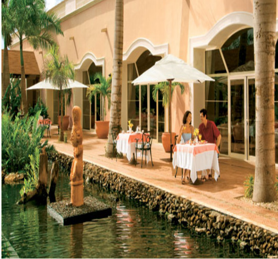
World Café Terrace