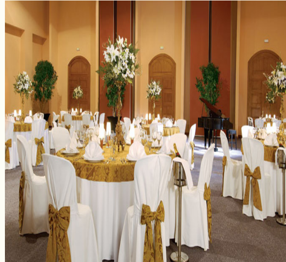
Santo Domingo Ballroom

Beautifully set around fountains and native Taino sculptures, this terrace is perfect for any type of event. It is on our main buffet restaurants side, with easy access to all our international cuisines.