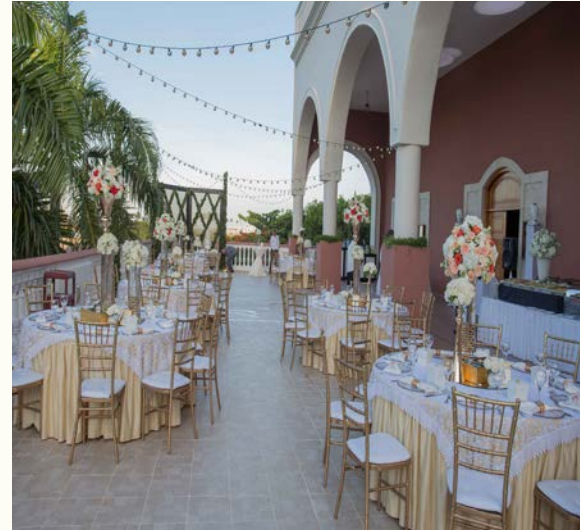
Himitsu Terrace Max Capacity 200

Set up in round and rectangular tables, it is surrounded by beautiful gardens and fountains. It's stone and wood outdoor decorations bring a very tropical and warm feel to any event.