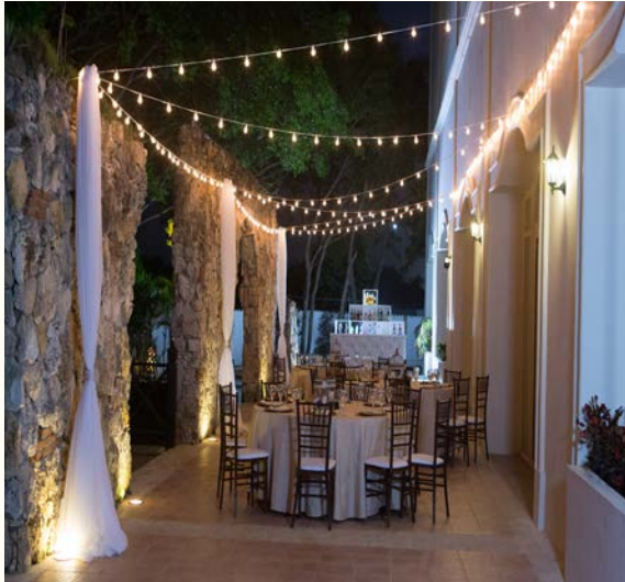
Portofino Terrace Max capacity 50

Set up in round and rectangular tables, it is surrounded by beautiful gardens and fountains. It's stone and wood outdoor decorations bring a very tropical and warm feel to any event.