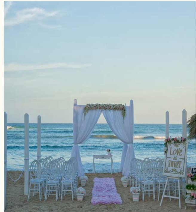
Beach Max 125