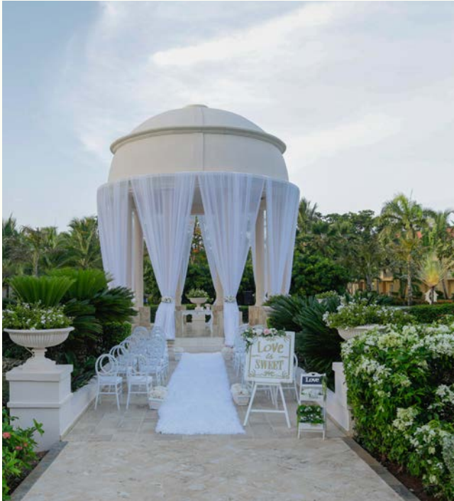
Gazebo Max 125